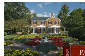
Glen Burnie Gardens and Mansion